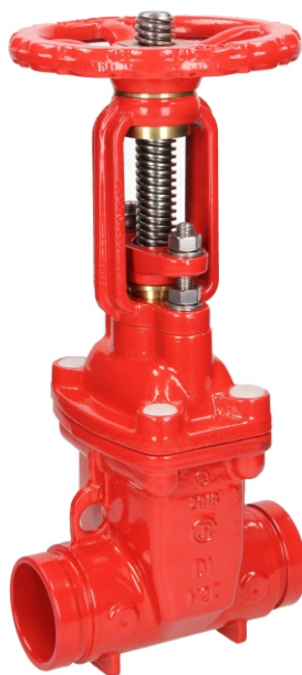
Gate valve 2261